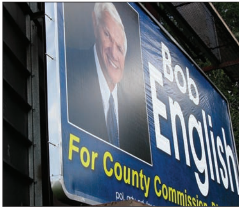
Close up of corner and side of Retro post