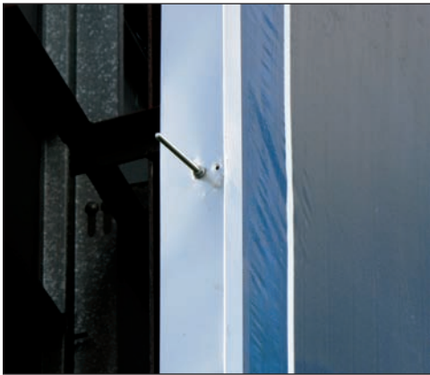
Close up of side of Retro post