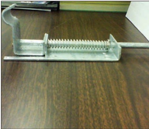
Spring loaded top bracket