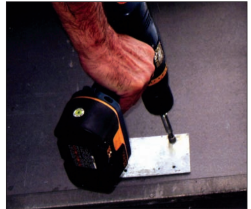
Installing back plate