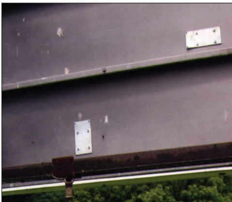
Completed back plates