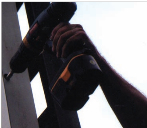
Adjusting side tensioning bracket