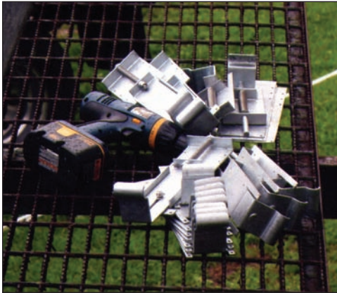
All parts needed

IRVIN STEEL A Division of Kvaerner International Inc.